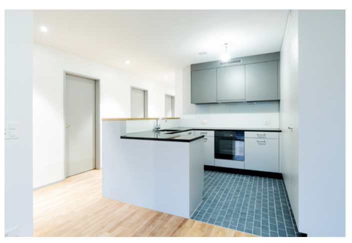
The stylish, modern apartments will go live for lettings from February and can be moved into from fall/winter.

Papieri's proximity to glorious natural surroundings and its riverside location are other plus points of the new neighborhood. «The new footbridge over the Lorze will connect the north and south banks. The riverside areas will become a lovely place to hang out and take a stroll, with benches for resting and outdoor fitness equipment for anyone who feels like a spot of exercise – Papieri's very own Muscle Beach,» grins White.