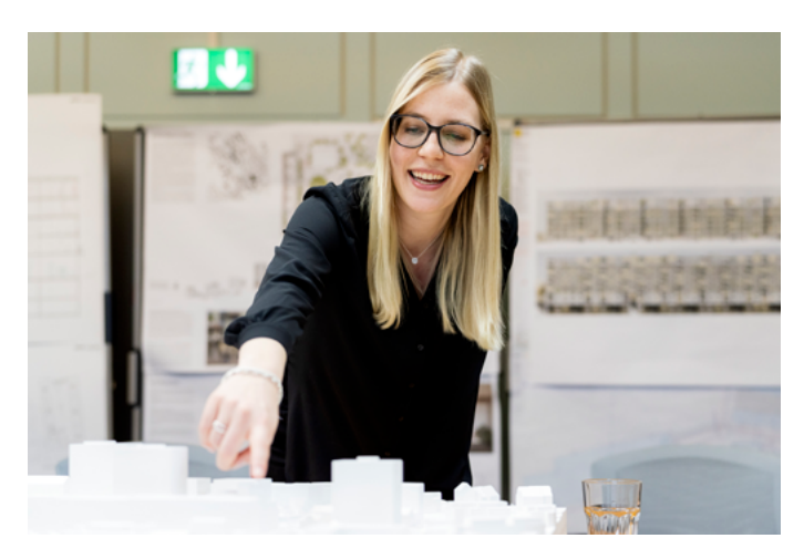
The first stage will be the letting of commercial premises and apartments in Buildings A, L and PM1–4 in turn...

Building A will be ready for occupation from this fall. A total of 163 apartments will be available for rental to suitable tenants. Finding a great mix of residents is a major area of focus for the Papieri development. Whether you're interested in a commercial space or an apartment, simply sign up to the list of prospective tenants and subscribe to the newsletter. That way, you'll automatically receive a link to apply for your dream property in advance of the official marketing launch. Bertelsen adds, "We're looking forward to showing off the rental properties to prospective tenants. We will be doing this for individuals and small groups – viewings will take place on an active construction site so there are certain hazards, and we have to comply with the safety precautions."